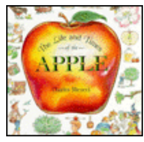
'The Life and Times of the Apple' by Charles Micucci

*The Georgia Department of Education (GaDOE) cannot and does not endorse or promote any commercial products, including books. Teachers and school leaders should check with their local district policy when selecting books to support instruction in determining age and content appropriateness for their students.